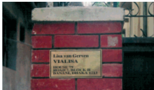
Our name sign

ASK tries to remove children from dangerous work environments through legal programmes. This only works when they can offer an alternative. Therefore, Vialisa and ASK started a partnership. This means that Vialisa can use ASK's drop-in-centres. ASK's social workers will share the profiles of the children of 13 and older. This will enable us to follow them for a period of time. For the children of 15 and older we will actively search for employment opportunities, to prevent them of having to accept badly paid jobs under bad conditions. We will regularly visit all the drop-in-centres to gain the children's trust, so we can help them optimally when necessary.